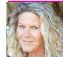
ALLEY MILLS The Wonder Years Bold and the Beautiful