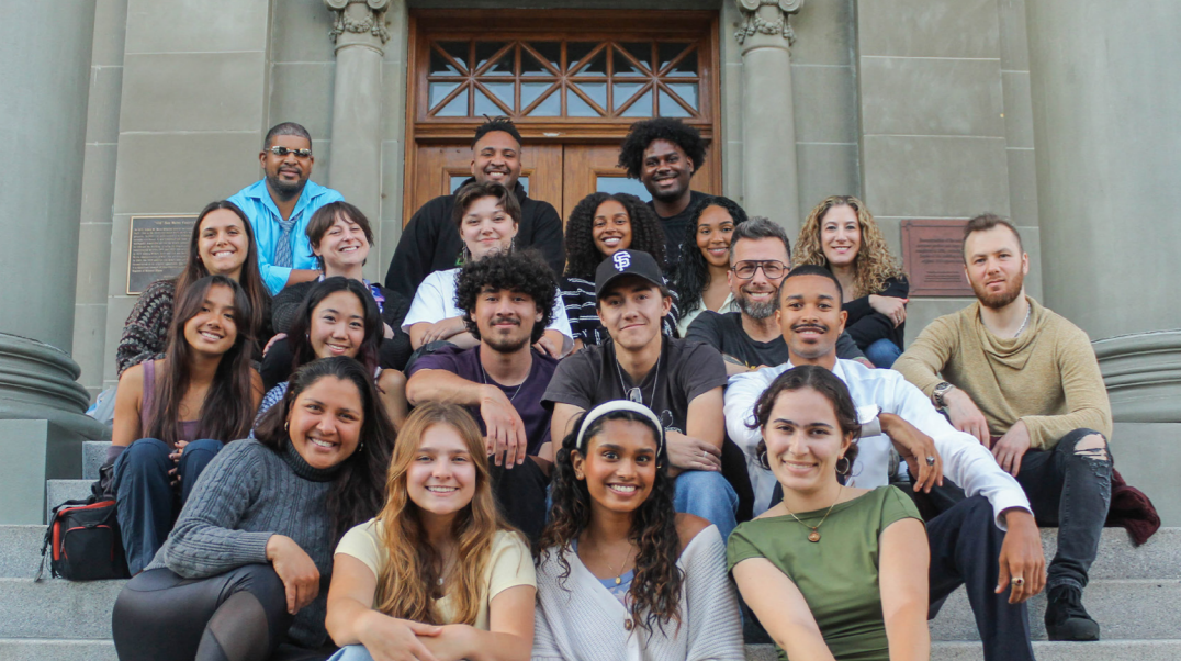
THE FIFTH ANNIVERSARY BRAVEMAKER FILM FEST TEAM

I almost didn't think we were going to be able to pull it off this year. We didn't have nearly as many sponsors as we needed. . . massive lay-offs in Silicon Valley, past sponsors unable to partner because of budget cuts but limitations breed creativity. My mantra? It'll all work out, just keep moving forward.